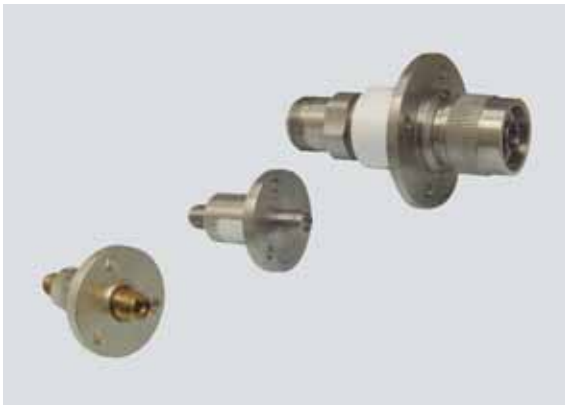
(Left to Right) RJ40, RJ18, RJ12

Coaxial single-channel rotary joint options include an internal RF path, an RJ mounting flange, and appropriate RF bulkhead connectors. Electrical travel limits remain but are typically disabled when this option is purchased.